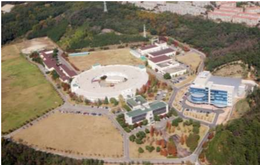
•Aerial View of the PAL