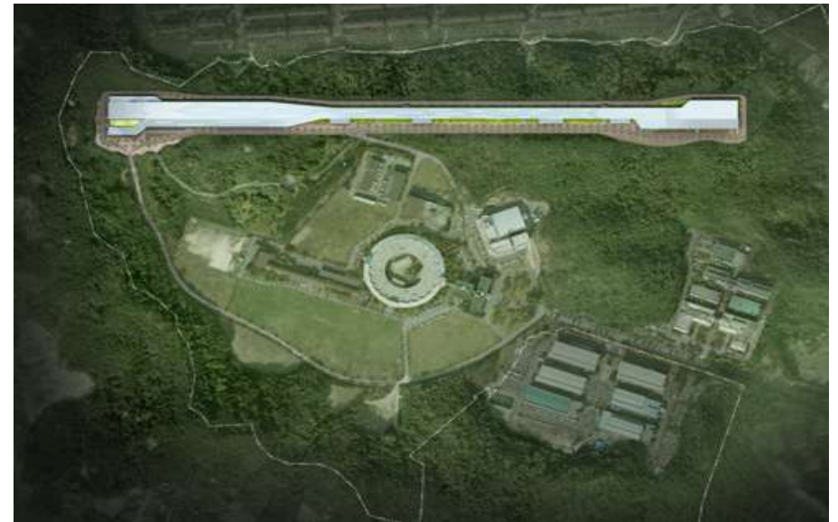
•After completion of PAL-XFEL