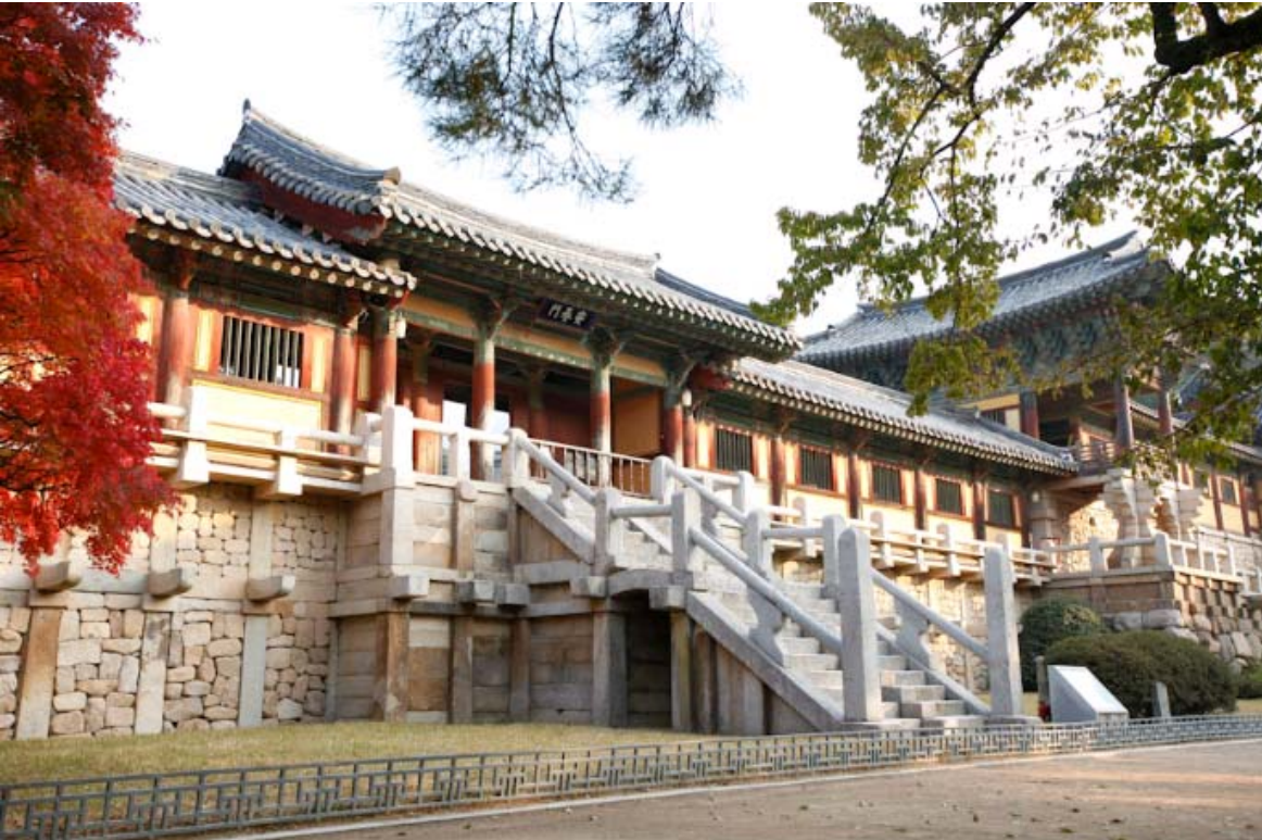
Bulguksa (佛國寺) temple