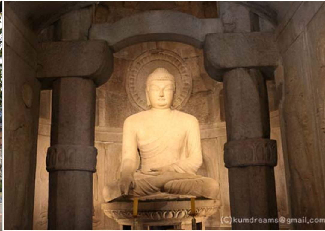
SukgulAm (石窟庵) grotto