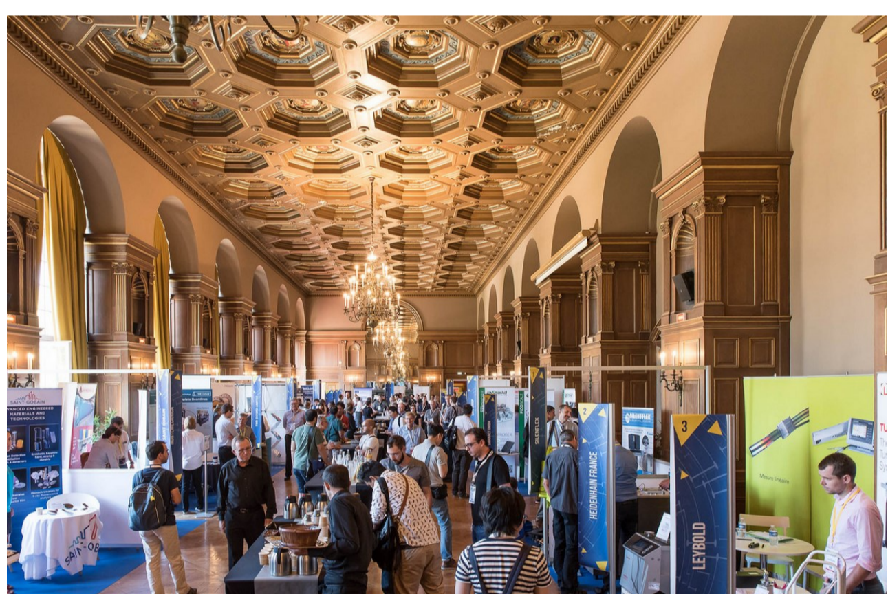
Catering in the exhibition hall.