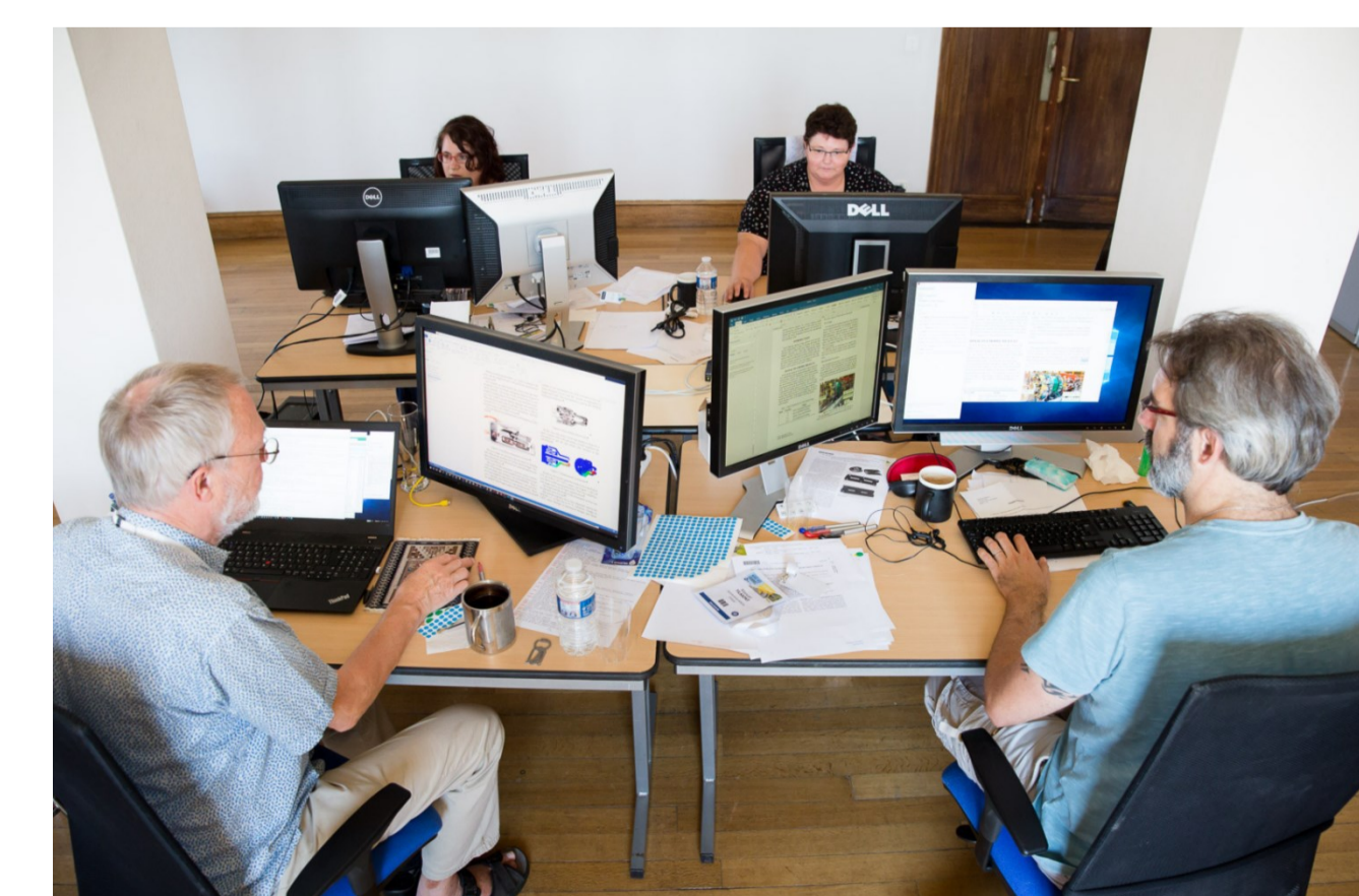
The setup seemed to be enough.