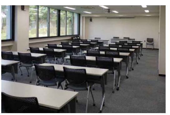
Meeting room with 40 seats