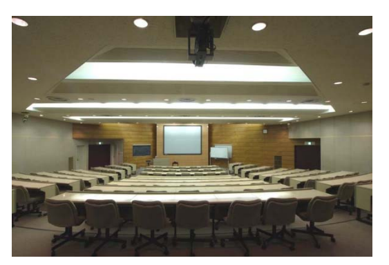
Seminar Hall with 130 seats