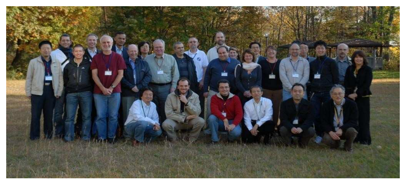
Figure 2: Example of a full-width figure showing the JACoW Team at their annual meeting in 2008. This figure is labelled with a multi-line caption which has to be justified, rather than centered.