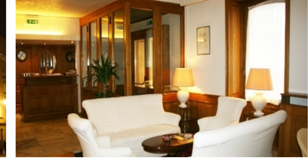
Hotel Abbazia (80€-100€)

Some rooms will be also available at the University youth hostel. The rate is Euro 20,00 / night.