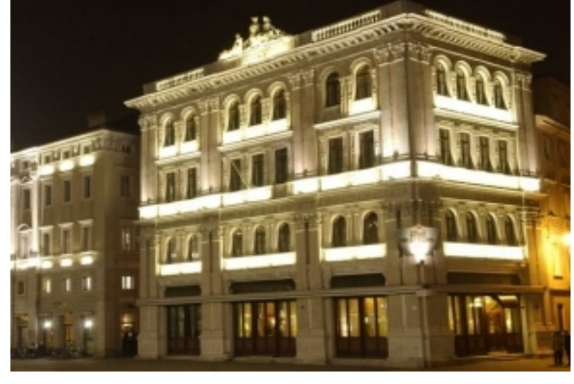
HOTEL DUCHI D'AOSTA 4* (180€ Single 200€ Double)