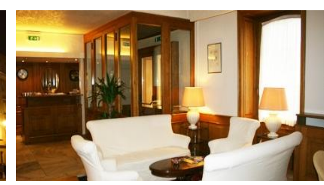
SAVOIA EXCELSIOR PALACE 4* (180€ Single 200€ Double)