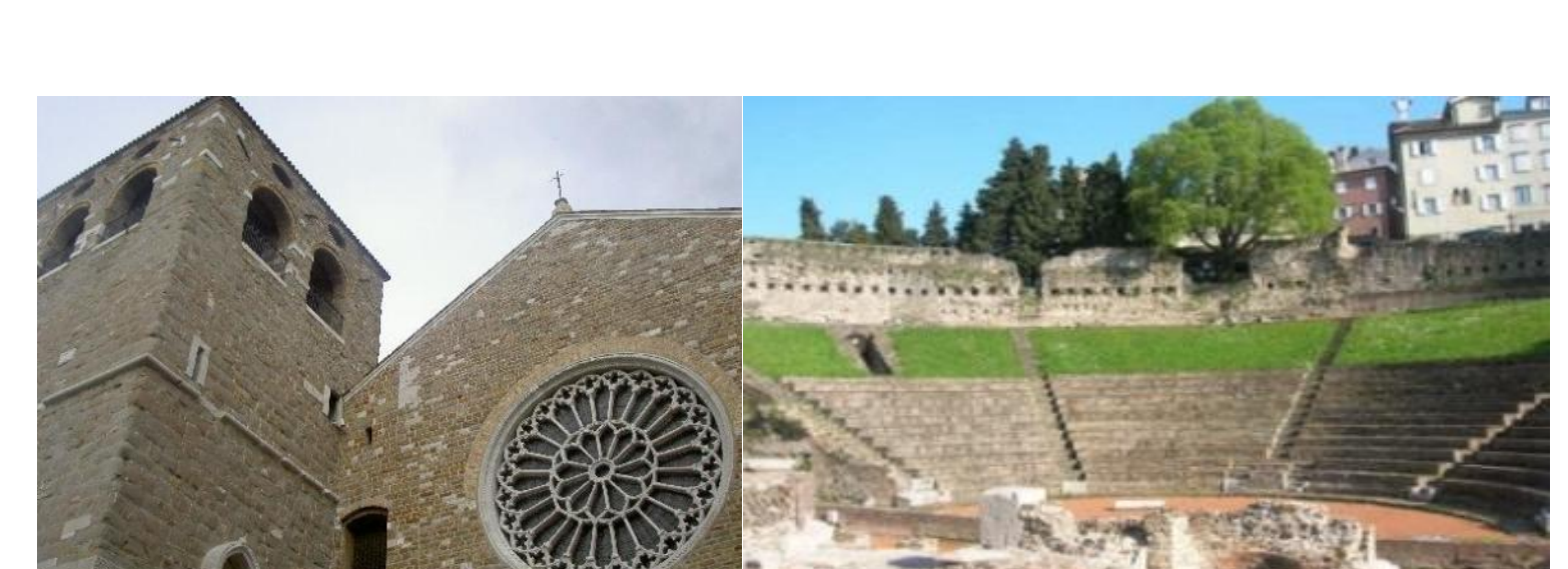
The ancient remains of Roman Trieste, the hill of San Giusto, the Cathedral and its mosaics.

Miramare Castle and city centre A half day excursion to discover the Hapsburg Myth visiting Miramare Castle, home to Maximilian and Carlotta, often visited by the Emperess Sissi, surrounded by the WWF Natural Park.